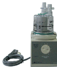
Temperate control system Nine gear with heating protection function