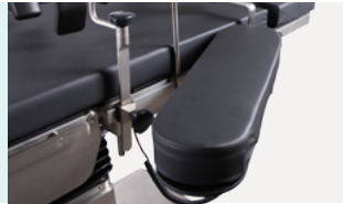
Leg Support with Cushion