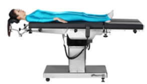
(Optional) Head Rest