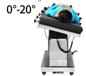
Lateral Tilt Right 0°-20°