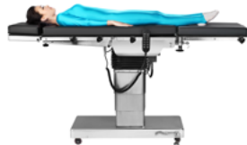
Highest Position of Table Top 1000mm