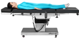
Lowest Position of Table Top 700mm