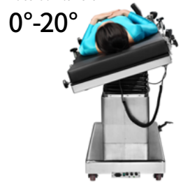
Lateral Tilt Left 0°-20°