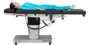
Longitudinal Adjustment 0-300mm